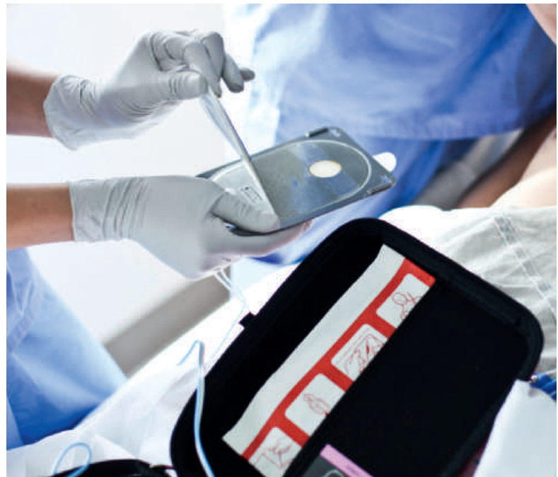
The HeartStart FR3 is the smallest and lightest professional-grade AED among the leading global manufacturers.