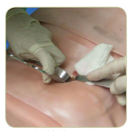
DIAGNOSTIC PERITONEAL LAVAGE