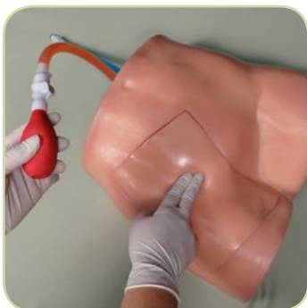
Palpate Arterial Pulse