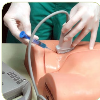
Self-sealing, Durable Tissue for Many Uses