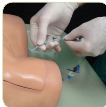
Full Central Venous Catheterization