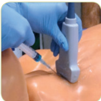
Ultrasound Guided with Appropriate Landmarks