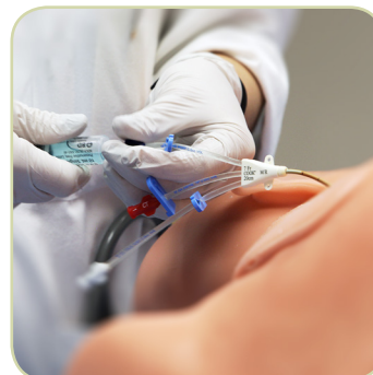
Full Central Venous Catheterization