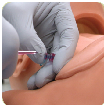
Self-sealing, Durable Tissue for Many Uses